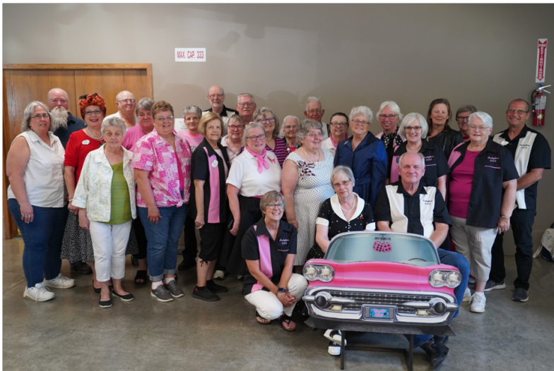
2022 Starlighters Grand Family