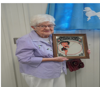
Our own "Betty Boop"