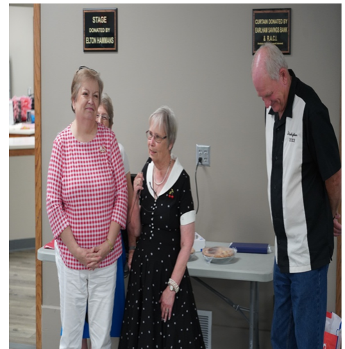
New Grand Representative Appointment