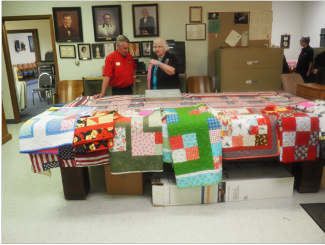
STARLIGHTERS AT ADEL FUN DAY, QUILTS FOR PARKINSON'S