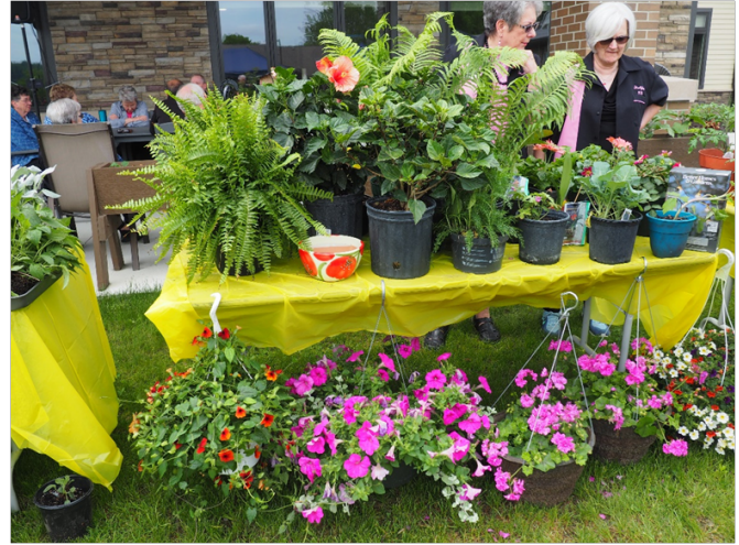
PLANTS FOR SALE BARTHELL PLANT SALE