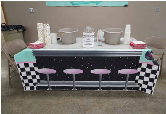
Ready for Ice Cream Sundaes and Root Beer Floats