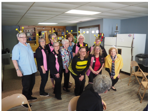
STARLIGHTERS UN-BEE-LIEVABLY FUN DAY IN CAMANCHE