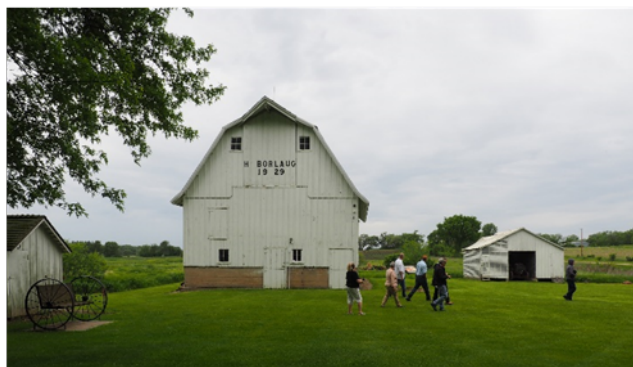
BORLAUG FARM VISIT