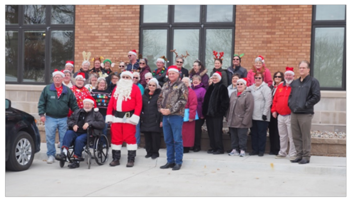
Starlighters visiting the Eastern Star Masonic Home in Boone