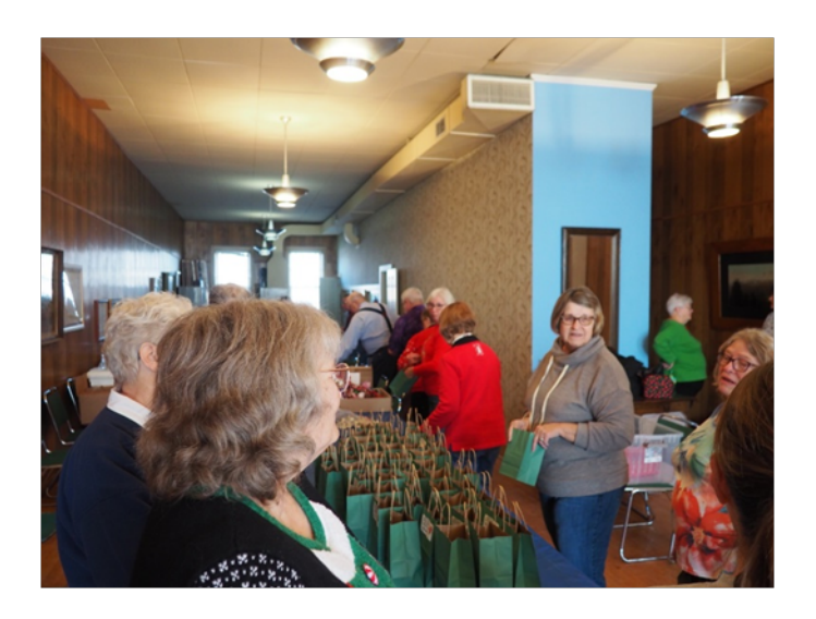
Christmas Gift Bag filling for the Barthell Home. Taking place at Great Light Lodge, Decorah