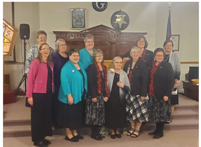
Smiles after State School Completion! District Instructors sharing a Sister moment for the cameral