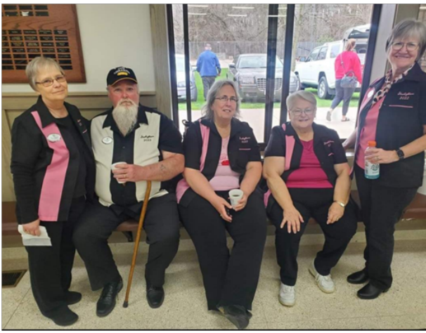
Starlighters taking a quick rest after a rush of breakfast eaters at Camp Courageous