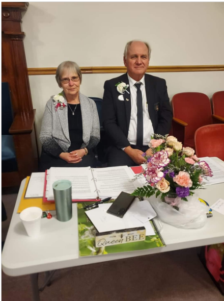
State School Duties....